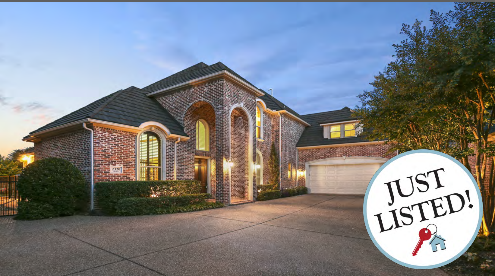
2320 Briar Court— Frisco, TX - Gated & Guarded Stonebriar Village 3BR | 3.1BTH | STUDY | 3LA W/GAME/MEDIA COMBO | 2GAR | POOL/SPA W-BLT-IN GRILL/OUTDOOR BAR - $610,000 4,056 sq. ft. —Built in 2000 — Jeff Pfeifer Custom

Lovely Custom Home tucked in from street for secluded privacy, offers lush landscaping on a quiet cul-de-sac in guard gated Stonebriar. Formal dining, study w-beamed ceilings, and built-ins. 1st-floor master superbly crafted w-pool views, attached bath w-romantic lighting, split vanities & jetted tub. Outstanding Chef's Kitchen w-dual ovens, granite counter tops, island, breakfast bar & butlers pantry. Beautifully designed family room w-wet bar ideal for entertaining! Upstairs 2 split bedrooms w-full baths, game/media room or 4th bedroom option. Backyard canvassed by trees & sparkling pool, spa, expanded patio, grilling station, & yard space. Low E Sound reducing windows! For a private showing call Judi Wright at 214-597-2985.