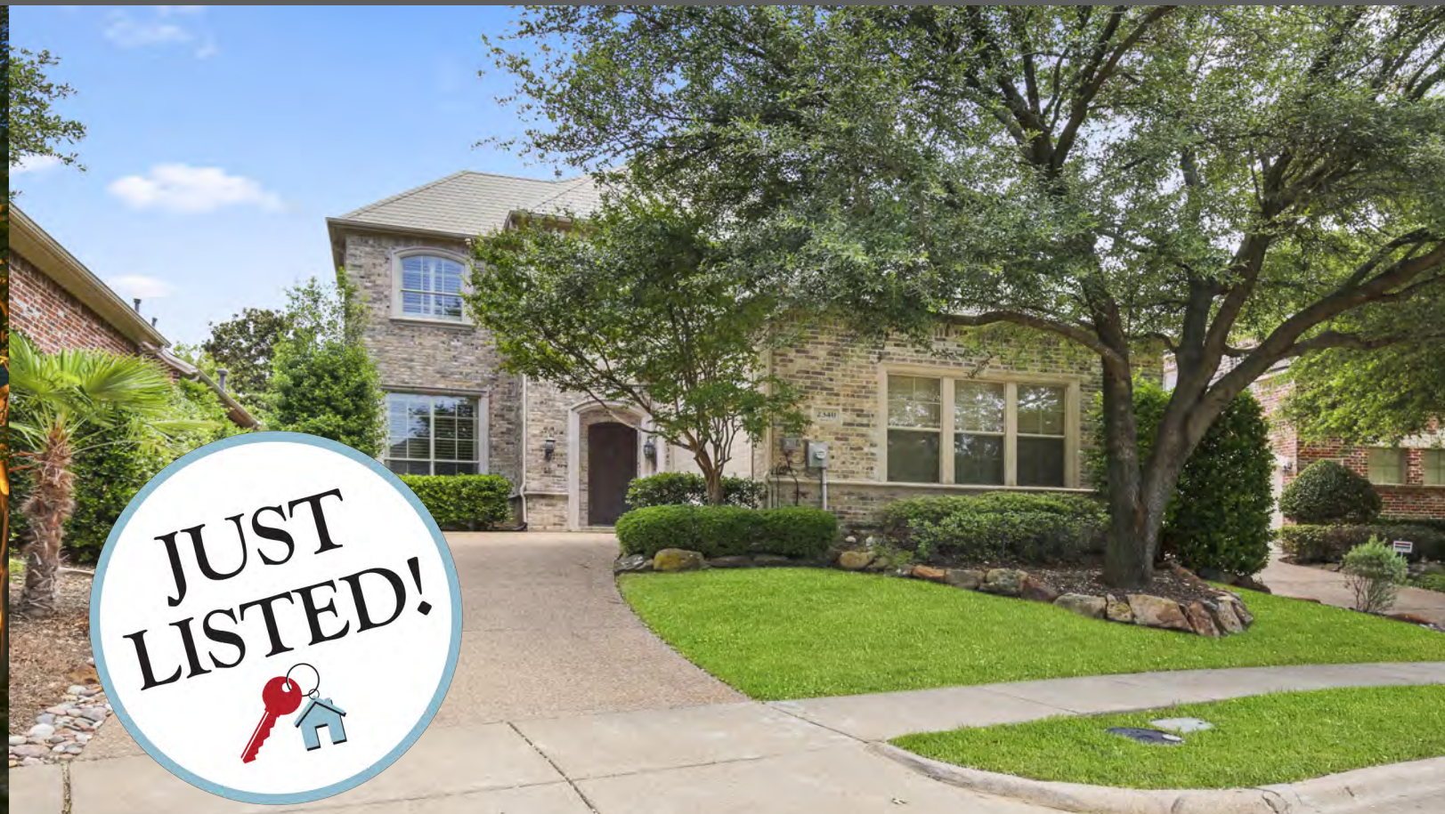
2340 Briar Court— Frisco, TX - Gated & Guarded Stonebriar Village 4BR | 3.1BTH | 2LA | 2GAR—Cul-de-Sac Media or 4th Bedroom—$525,000 2,230 sq. ft. —Built in 1994—Built by Darling Homes

Lovely Custom Home tucked in from street for secluded privacy, offers lush landscaping on a quiet cul-de-sac in guard gated Stonebriar. Formal dining, study w-beamed ceilings, and built-ins. 1st-floor master superbly crafted w-pool views, attached bath w-romantic lighting, split vanities & jetted tub. Outstanding Chef's Kitchen w-dual ovens, granite counter tops, island, breakfast bar & butlers pantry. Beautifully designed family room w-wet bar ideal for entertaining! Upstairs 2 split bedrooms w-full baths, game/media room or 4th bedroom option. Backyard canvassed by trees & sparkling pool, spa, expanded patio, grilling station, & yard space. Low E Sound reducing windows! For a private showing call Judi Wright at 214-597-2985.