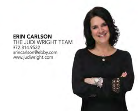
ASK ABOUT OUR WHEN YOU BUY OR SELL A HOME.

RETIRED MILITARY, RESERVISTS WOUNDED WARRIORS, POLICE