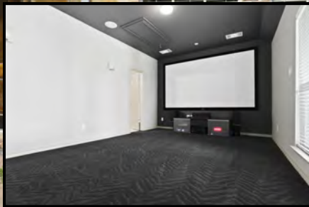
5727 Knox Drive, Plano, TX — Townhomes at Legacy 3BR | 3.1BTH | 2GAR | BLT 2011 | 1,930 SQ. FT. | Interior Unit $399,900 Updated & Freshly Painted

Lovely updated interior Townhome in a premium location away from busy streets. HW flooring & a Kitchen w-a Breakfast bar, granite c-tops, decorator BS. The Family Room cast stone FP (w-gas logs) adds character & warmth. The Primary Bedroom is oversized & the Bath features 2 sinks, granite, garden tub and a separate shower. Each Bedroom has it's own bath and the 1st floor offers a half bath. The 3rd Floor oversized Bedroom is being used as a Media Room (projector and 133" screen remain) w-En Suite Bath & Closet. The oversized balcony has views of Granite Park! Includes all Home Theater equipment (Projector, Screen, Audio), 3 Nest Thermostats and Philips Hue programmable LED Lighting on 1st floor. Bonus — Guest parking in front! For a Private Showing Contact Judi at 214-597-2985.