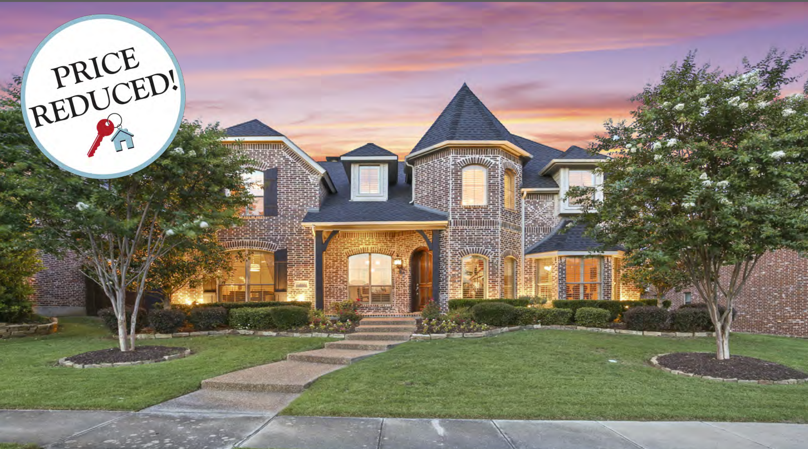
4542 Carraway Drive— Frisco, TX - Lakeside at Lone Star Ranch — REDUCED $525,000 5BR | 4BTH | STUDY | 4LA | 3GAR | .21 ACRE LOT | BUILT IN 2005 | 4,566 sq. ft. Sotherby Built Beauty

Impressive Lone Star Ranch Sotherby home with curb appeal! Grand entry showcases upgraded lighting + hand scraped wood floors. Formal Dining w-bay windows, Plantation shutters, Living w-soaring ceilings, Juliet balcony + stone FP. Handsome Study! Island Kitchen offers SS appl, dual ovens, built-in MW, electric cooktop (gas stub) + Butlers pantry! 1st Floor private Guest Suite! Beautifully appointed Master Suite w-en-suite bath! 2nd Floor w-massive Game Room, Wet Bar & Media room! Three Bedroom's up, one w-full Bath + an additional living or play area & 2 more Bedrooms that share a J-and-J bath. Charming BY w-an open patio, herb garden & high privacy fence! Community Pools, Workout, Trails, Playground plus more! For a private showing call Judi Wright at 214-597-2985.