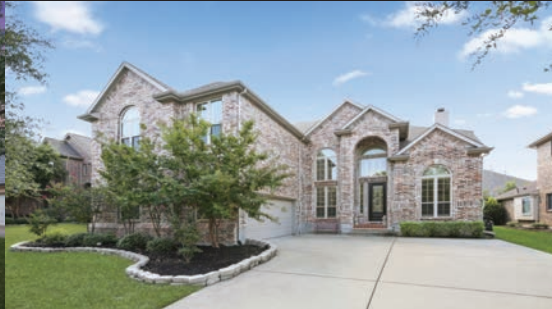
9713 Avalon— Frisco, TX Crown Ridge Closed & Funded Congrats Washington Family!