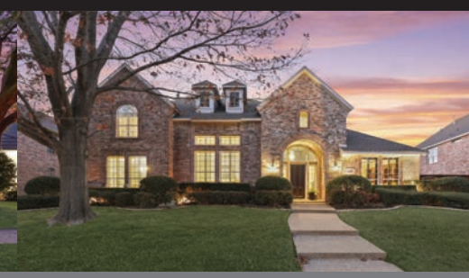
5629 Risborough — Plano, TX Castlemere @ Willow Bend Closed & Funded Congratulations Sulzer Family!