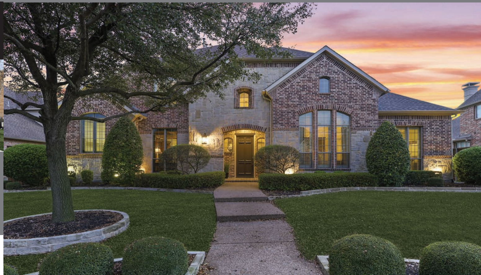
11567 Coronado Trail, Frisco, TX — Country Club Ridge at The Trails 4BR | Study | Bonus | 3.1BTH | 4LA | 4+GAR | BLT 2005 | 4,364 SQ. FT. REDUCED $695,000 —- Pebbletech Pool/Spa & Gated Side Yard

Huntington Built beauty in sought-after Frisco neighborhood feeding to Wakeland High School showcasing elegant soaring ceilings, dual staircases + much more. Handsome Study w-blt-ins & coffered ceilings, Formal LR & DR, Chef's Kitchen w-top of the line Viking Appliances, downstairs Master w-Sitting Area, spa-like bath & huge walk-in closet. FR open to Kitchen & Breakfast. Upstairs Game, Media, 3 Bedrooms & Bonus Room (Fitness/Craft or 5th Bedroom?). Back Yard features a beautiful Pebbletech Pool/Spa + separate gated Side Yard. Oversized 3 Car tandem garage, almost enough for 5 cars! Don't miss—for a private showing call Judi at 214-597-2985.