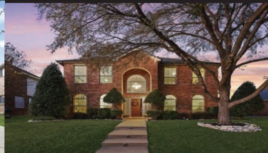
9810 Shirland — Frisco, TX Prestmont Closed & Funded Congratulations!