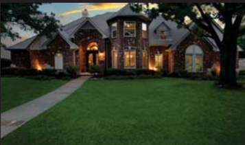
4 Harbour Town Ct—Frisco, TX Stonebriar Village The Horton Family