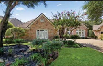
3104 Hampshire Court—Frisco, TX Stonebriar Village PENDING