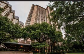
3525 Turtle Creek #3B—Dallas, TX 3525 Condominiums PENDING