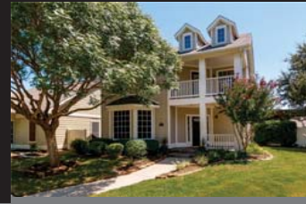
9872 Walnut Hill—Aubrey, TX Providence Village Sold by Monica Otis