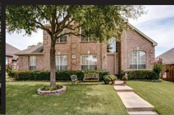
3620 Estacado—Plano, TX Ridgeview Ranch PENDING