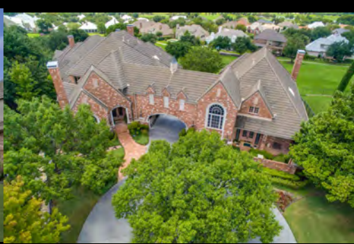
5030 Southern Hills—Frisco Stonebriar Village The Canning Family