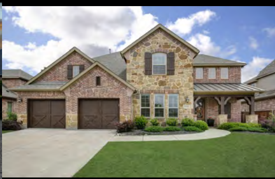
11126 Abercrombie—Frisco, TX Arbors of Willow Bay The Lowe Family