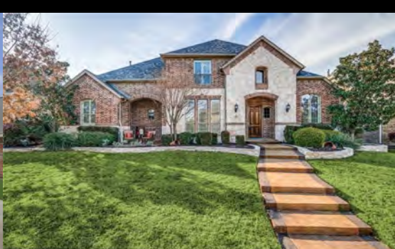
644 Duke Saxony—Lewisville Castle Hills The Estervig Family